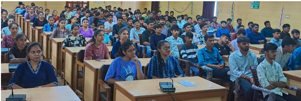
In-house participation of the students from CoA, JAU, Junagadh, in the workshop